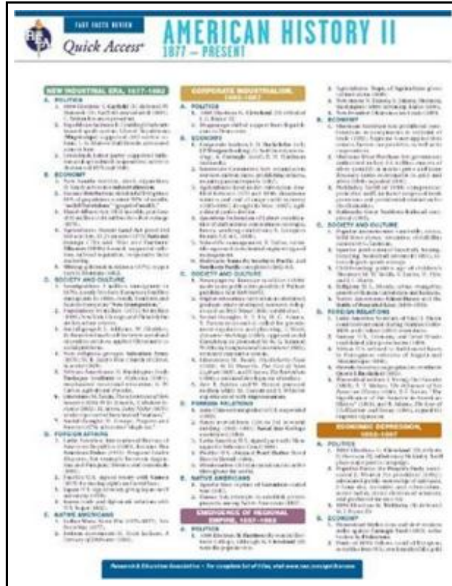
Filesize: 3.61 MB